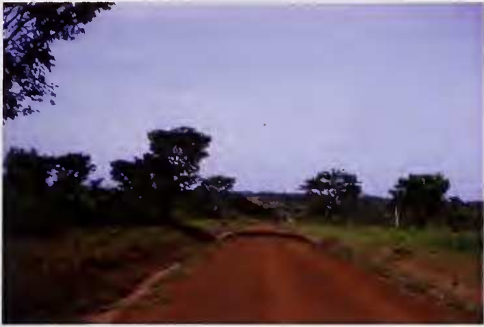
Fig. 3. Landscape round the village of Didja, southern Benin.

type (Mondjokannagni 1969) and of secondary forest in various developmental stages. Within this dynamic system, the South American fast-growing asteracean neophyte Chromolaema odorata is commonly found along small roads and paths and at the forest edges. In smaller plantations, next to the larger ones with teak, trees such as Gmelina arborea , fraké ( Terminalia superba ), samba wood ( Triplochiton skleroxylon ) and, especially in the Toffo sector, the fire-resistant Cassia siamea are cultivated (Specht 2002).